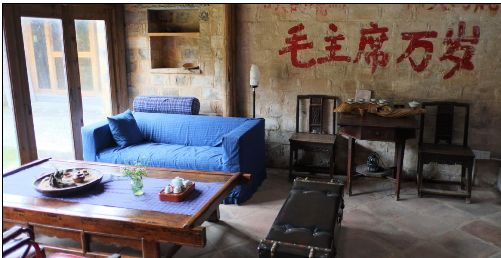
Pig's Inn 3

The latest addition to the Pig's Inn collection, Pig's Inn 3 has a history as unlikely as that of the Xidi property that started the chain. An ongoing development, Pig's Inn 3 has been converted, not from a pig pen, but from an old rapeseed oil factory. It's a much more spacious property than Pig's Inn Xidi, set in its own private grounds with vegetable gardens and a large open courtyard. The original factory floors have been converted into spacious lounge areas, beautifully decked out in the lively style that has become the Pig's Inn trademark.