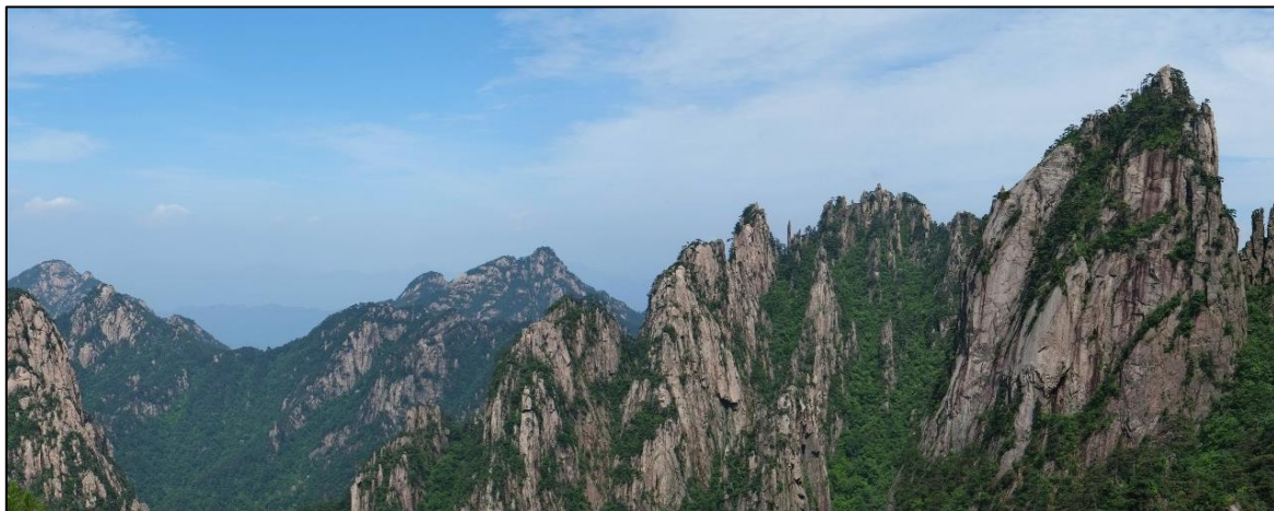
Huangshan in June

NB. It's possible to skip the cable car journey and climb all the way to the top of Huangshan on foot. The route is easy (there are stairs most of the way), but it's a long climb and generally requires a very early start or a night in one of the hotels on the mountain. During the summer the trail can become very crowded.