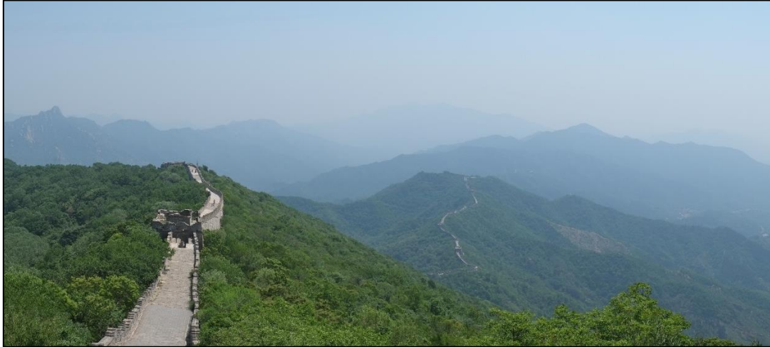
Great Wall of China

After breakfast at your hotel, enjoy a full day of sightseeing in and around Beijing. Start with Tiananmen Square and the Forbidden City, the traditional landmarks that form the cultural and geographic heart of Beijing. The Forbidden City is a vast complex, housing nearly 1,000 buildings. Allow 2-3 hours to explore the site.