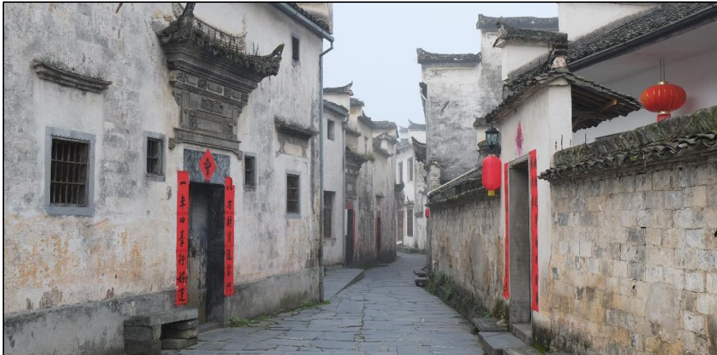
Xidi in the early morning

In the afternoon, meet with your guide and drive to Hongcun, sister village to Xidi. Perhaps the most photographed village in all of Anhui province, Hongcun attracts a larger volume of tourists than Xidi. Whereas most of Xidi's buildings are still residential homes, Hongcun is filled with trinket shops, restaurants and guesthouses, making it a better place to visit on a day trip than an overnight stay. But it is also, like Xidi, a beautifully-preserved village that retains many of its original features. It houses centuries-old Ming and Qing-era residences, alongside old family halls, temples and schools, all built in the regional style. Hongcun's standout features, however, are its crystal clear moat and crescent-shaped pond, crossed by carved stone bridges on either side of the village.