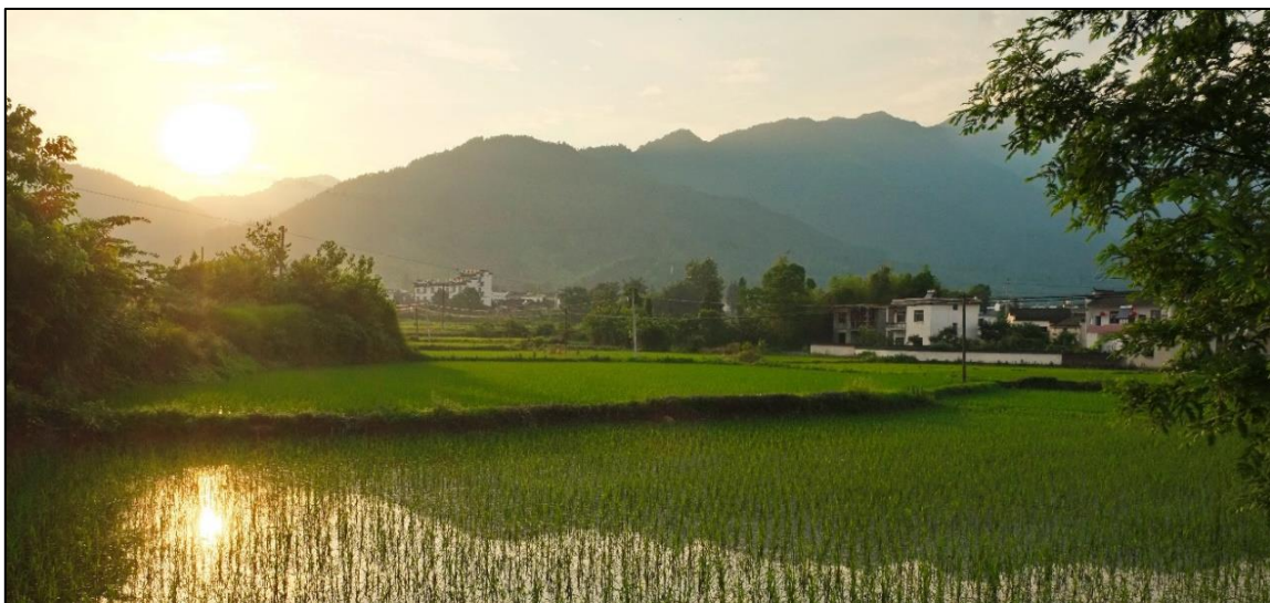
Sunset in Bishan

More popular is the Mukeng Bamboo Forest, a beautiful forest park within easy reach of Bishan. You can spend an afternoon exploring its trails, before stopping to rest at a cosy tea house on the shores of a lake.