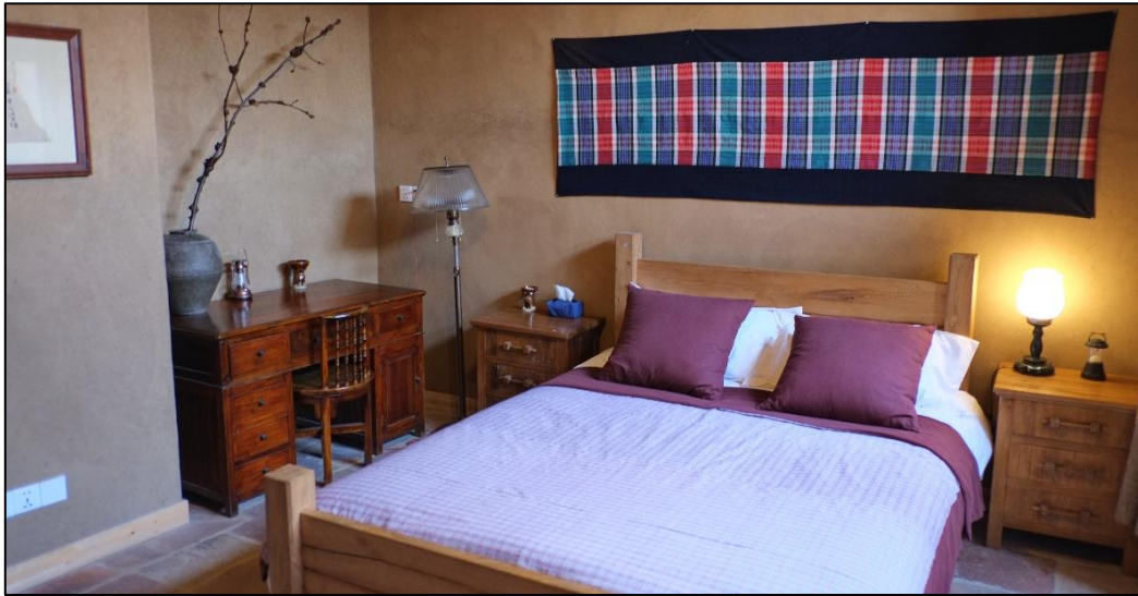
Pig's Inn 3

NB. Pig's Inn 3 is an ongoing development and parts of the lodge are still being developed, though not the rooms and the main public areas.